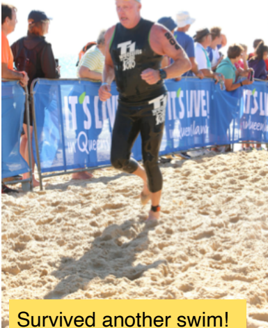
Survived another swim!