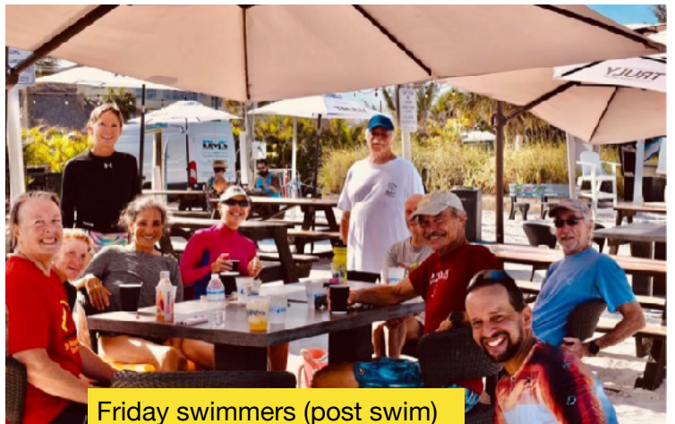
Friday swimmers (post swim)