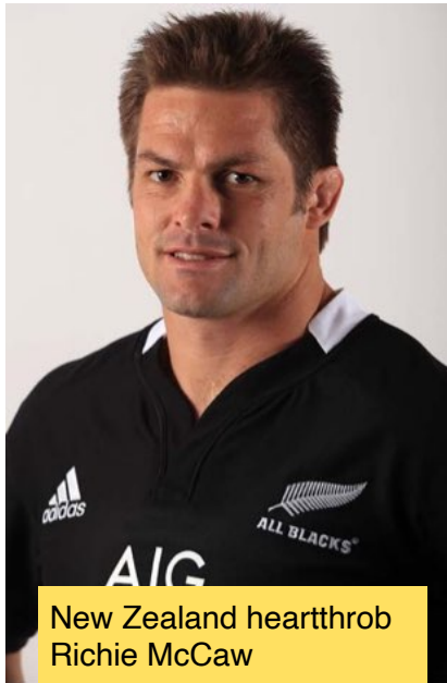
New Zealand heartthrob Richie McCaw