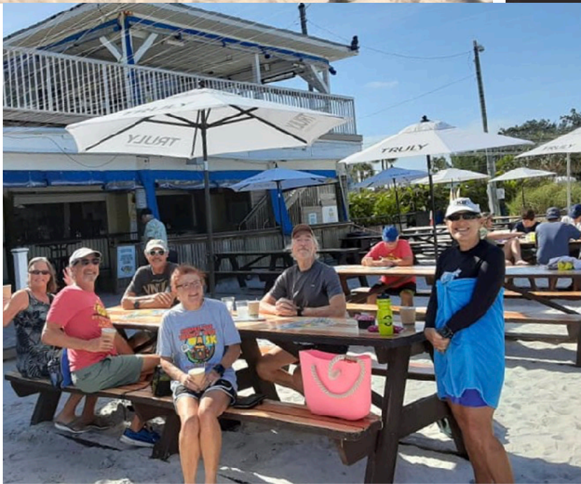
Mad Dogs unleashed at Sunset Beach!