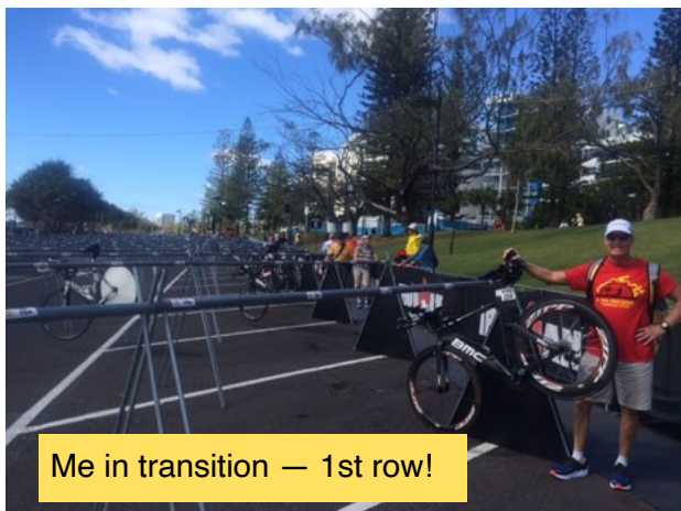
Me in transition — 1st row!