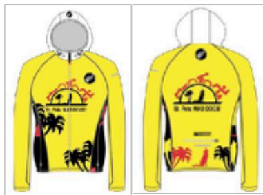
Mens/Womens Hoodie Tech Shirt - $50

Is there anything else you would like to see? Send an email to cskipper@gmail.com We can arrange to have any of the following items: