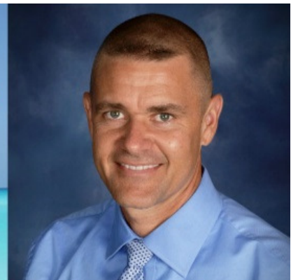
Proud Member St Pete Mad Dogs Multi Ironman Finisher

My proven strategies get your home sold fast at the best possible price.