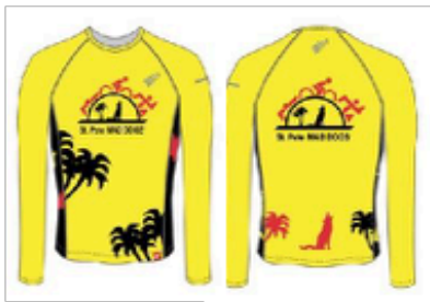
Mens/Womens Long Sleeve Tech Shirt - $50