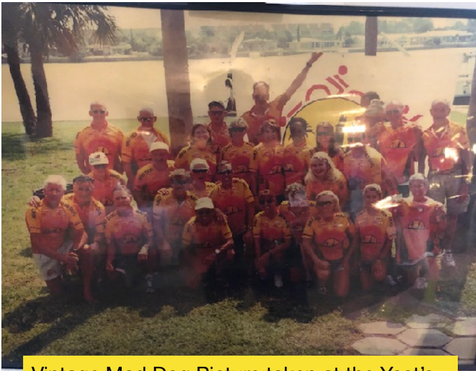
Vintage Mad Dog Picture taken at the Yost's