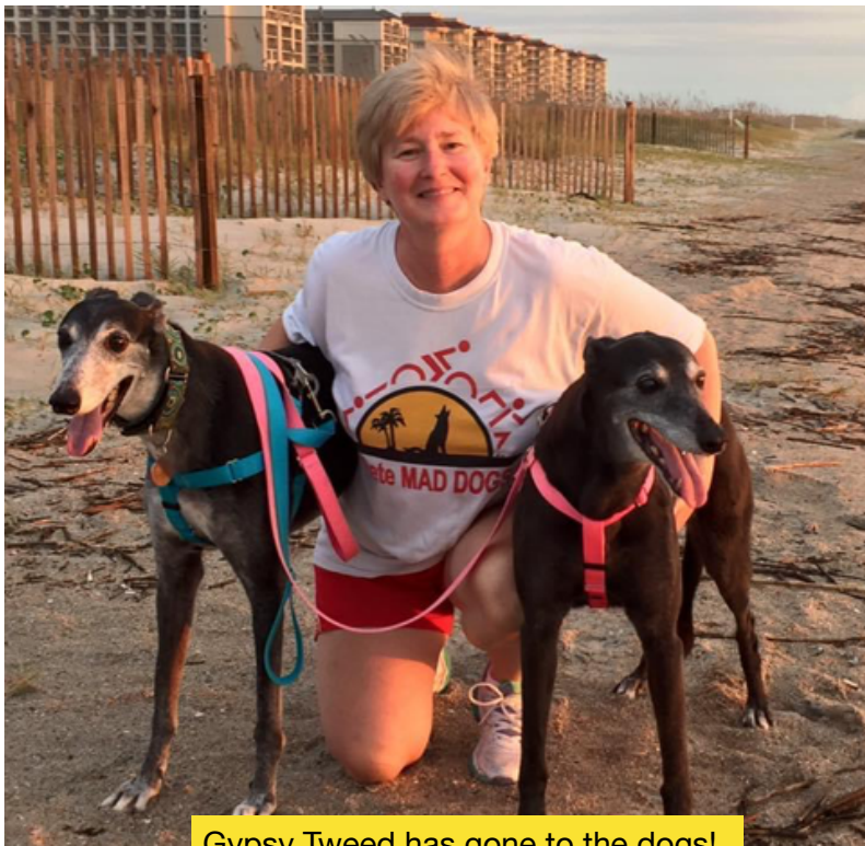
Gypsy Tweed has gone to the dogs!