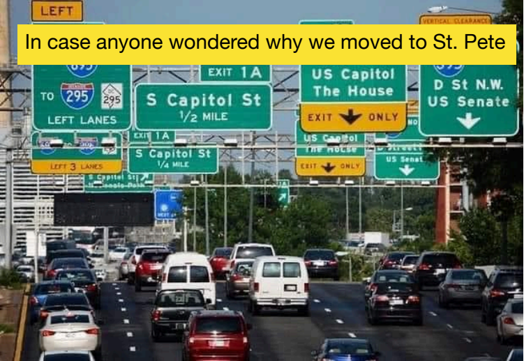
In case anyone wondered why we moved to St. Pete