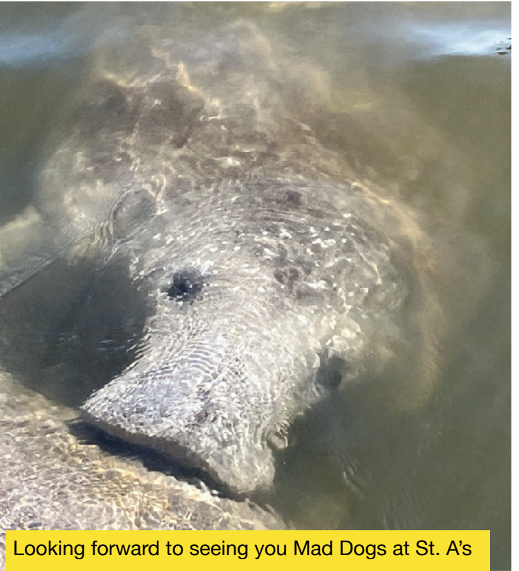
Looking forward to seeing you Mad Dogs at St. A's