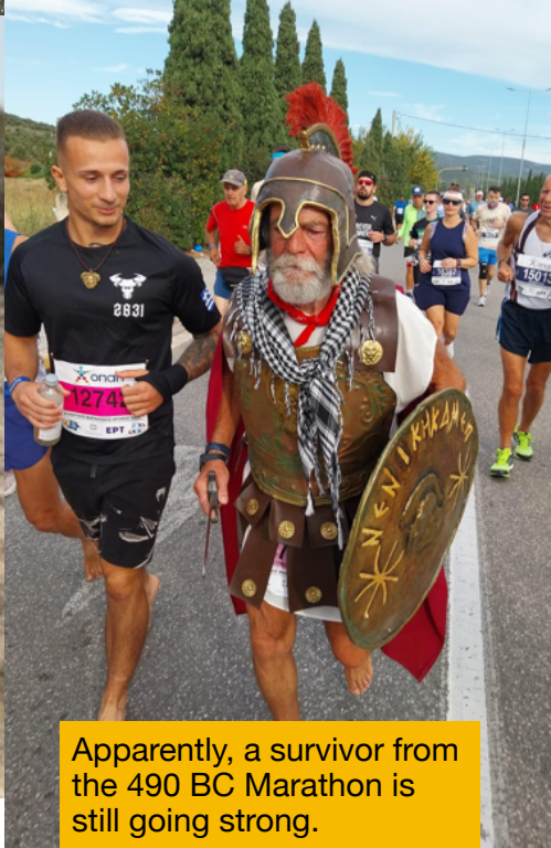
Apparently, a survivor from the 490 BC Marathon is still going strong.