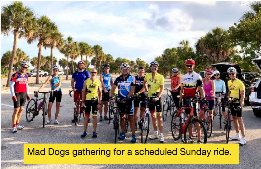
Mad Dogs gathering for a scheduled Sunday ride.