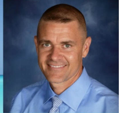
Proud Member St Pete Mad Dogs Multi Ironman Finisher

My proven strategies get your home sold fast at the best possible price.