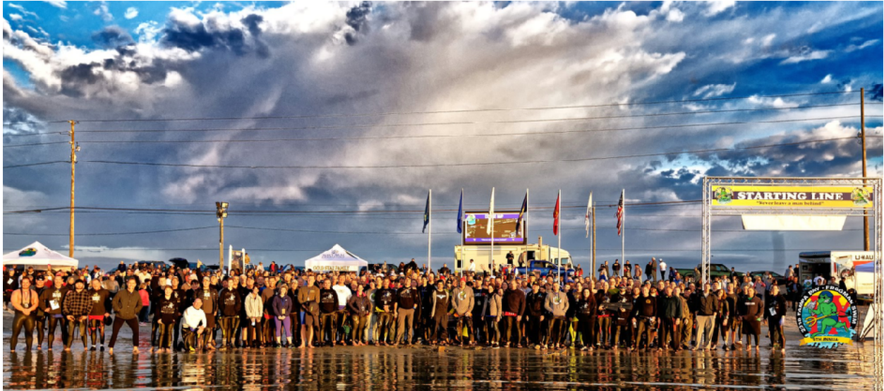
Participants in the 2018 Tampa Bay Frogman Swim.. Swimmers raised about $650K this year setting a new record while crossing Tampa Bay in 57 degree temperature.