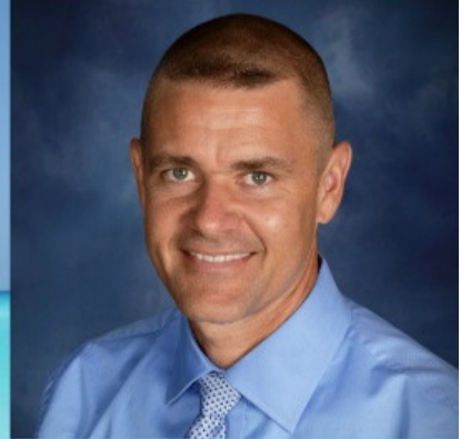
Proud Member St Pete Mad Dogs Multi Ironman Finisher

My proven strategies get your home sold fast at the best possible price.