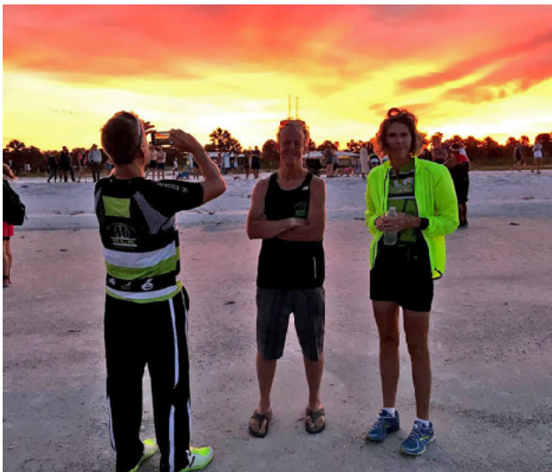
Great sunrise shot at the FD3 #3 race at Fort DeSoto