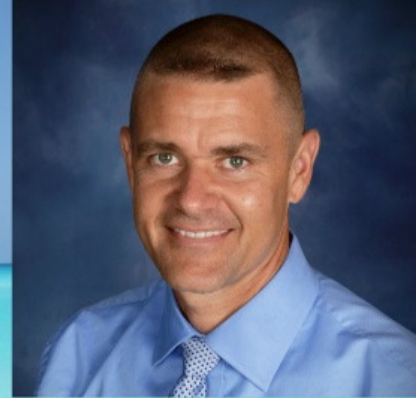
Proud Member St Pete Mad Dogs Multi Ironman Finisher

My proven strategies get your home sold fast at the best possible price.