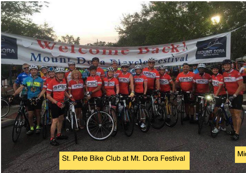
St. Pete Bike Club at Mt. Dora Festival